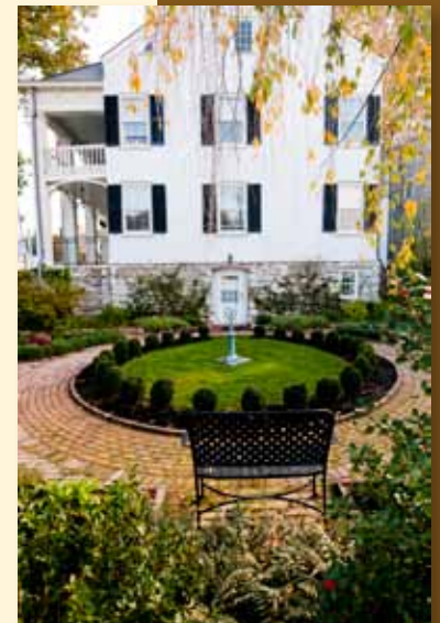
Phoenix House Garden