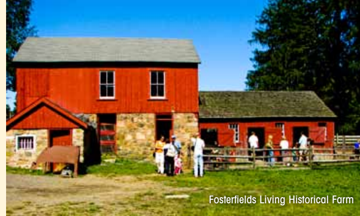
Fosterfields Living Historical Farm